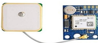
Fig. 5 GPS module

All the above-mentioned components are used to shape our system and the result of hardware implementation is as follows