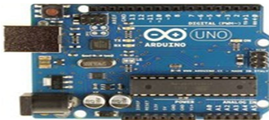
Fig. 3 Arduino UNO board