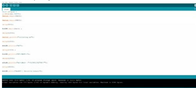
Fig. 7 Arduino IDE Interface

ARDUINO IDE is a software application for Arduino UNO and many other microcontrollers. ARDUINO IDE runs under Windows and IOS. ARDUINO IDE enables execution of ARDUINO programs. ARDUINO IDE incorporates a number of different libraries and several customizations. In our software implementation, we used different libraries such as GPRS_SIM900-master, GSM, GPRS, GPS, Shield_GSM, SHIE LD, TinyGPS++, Tiny GSM and we could achieve our software functionality through them. We have to write the code as per our functionality to get the desired results.