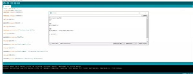
Fig.8 Serial Monitor Executing AT commands