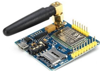
Fig. 1 GSM module