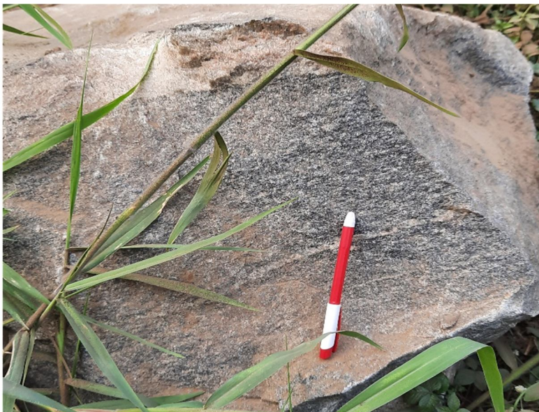
Fig. 10 Field photograph showing quartz laminations

This study area is dominated by massive laminated granite gneiss. Granite gneiss is showing thick quartz bands. The granite gneiss is medium grained and is showing high mica content.