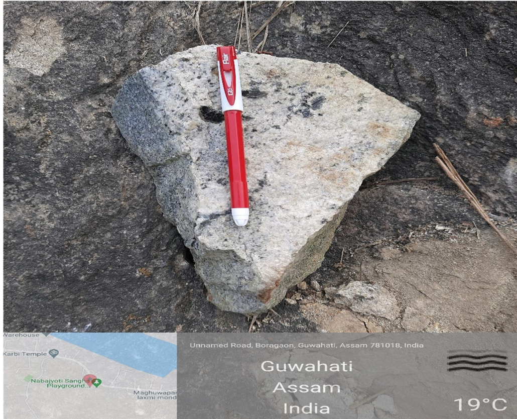
Fig. 8 Field photograph showing coarse grained minerals of biotite

The rock types of Pamohi area include foliated granite gneiss (Sarma H. D. 2018). During field study it is seen that the Pamohi area is dominated by medium grained granite and medium grained granite gneiss. Medium grained granites are composed of mostly medium grained quartz with occasional presence of very large sized biotite (mica) (Fig. 8). The topography is dominated by rugged granites showing no weathering and with three sets of joints.