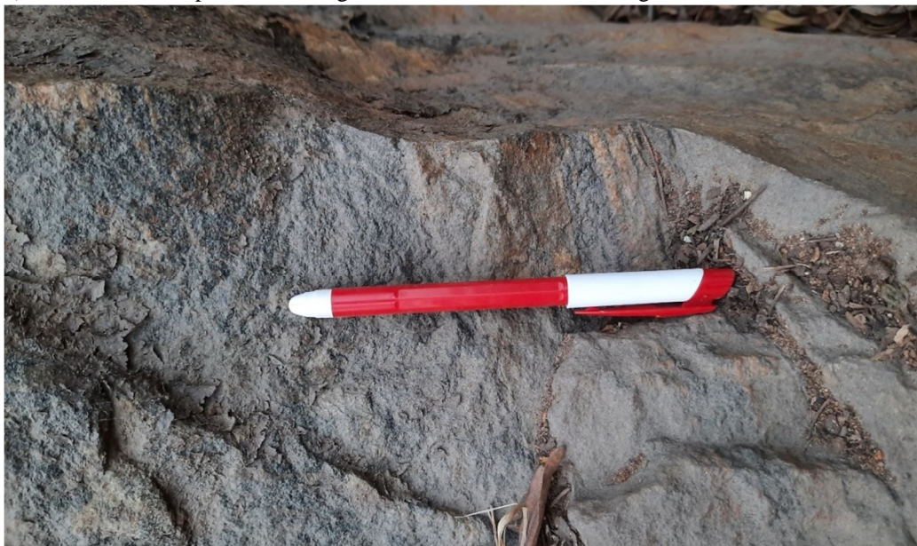
Fig. 11 Field photograph showing alternate bands of quartz and mica laminations

The Borbari area is dominated by medium grained granites where thin alternate bands/laminations of mica and quartz are very prominent (Fig. 11). Granites are sharp and medium grained. Presence of weathered granites is also observed in the area.