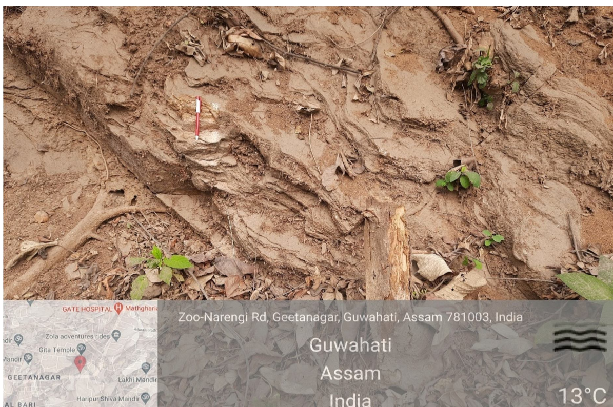
Fig. 3 Field photograph showing the foliations of weathered bedrock