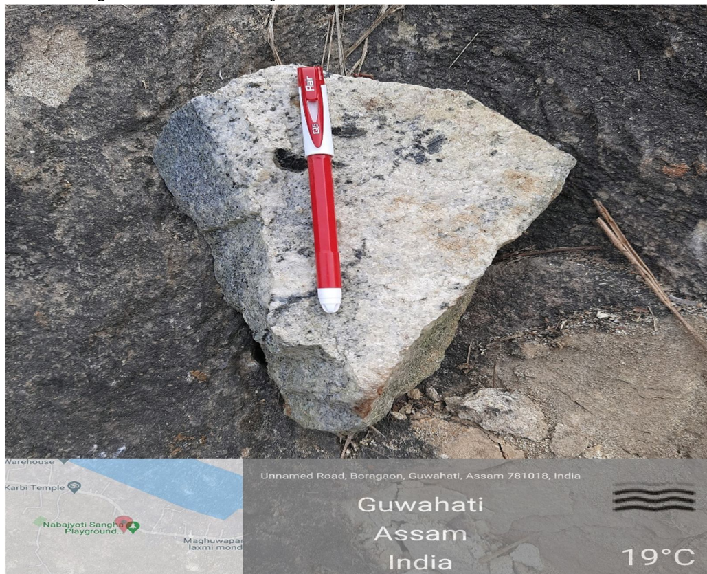
Fig. 8 Field photograph showing coarse grained minerals of biotite

The rock types of Pamohi area include foliated granite gneiss (Sarma H. D. 2018). During field study it is seen that the Pamohi area is dominated by medium grained granite and medium grained granite gneiss. Medium grained granites are composed of mostly medium grained quartz with occasional presence of very large sized biotite (mica) (Fig. 8). The topography is dominated by rugged granites showing no weathering and with three sets of joints.