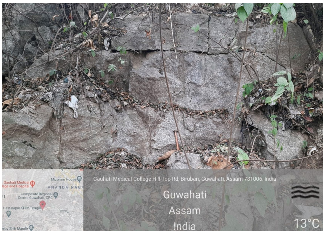
Fig. 5 Field photograph showing prominent joints of granite