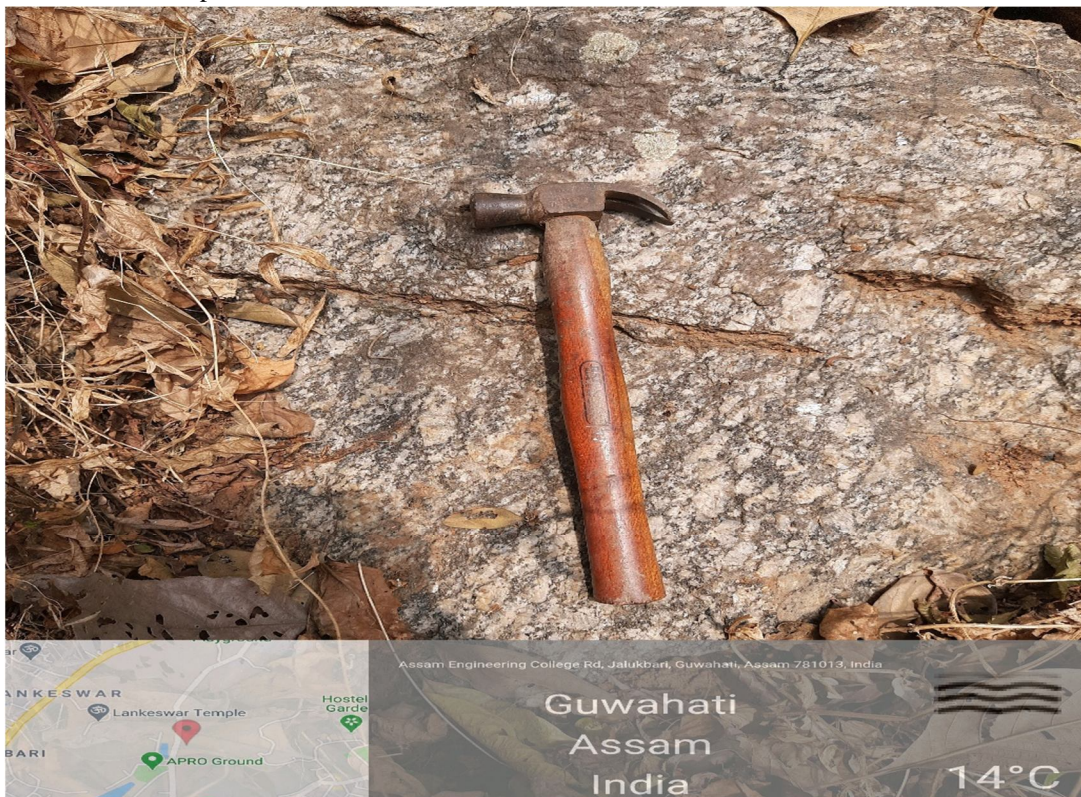
Fig. 6 Field photograph showing coarse grained granite

The study area is dominated by coarse grained granite. Massive granite present in the study area is very rugged or sharp, showing no weathering (Fig.7). Minerals present in granite are very coarse grained rose (pink) quartz, mica and feldspar with sharp contact with each other (Fig. 6). One set of less prominent joint is also observed in the study area. Very sharp contact of minerals of granite indicates very low or no metamorphic effect.