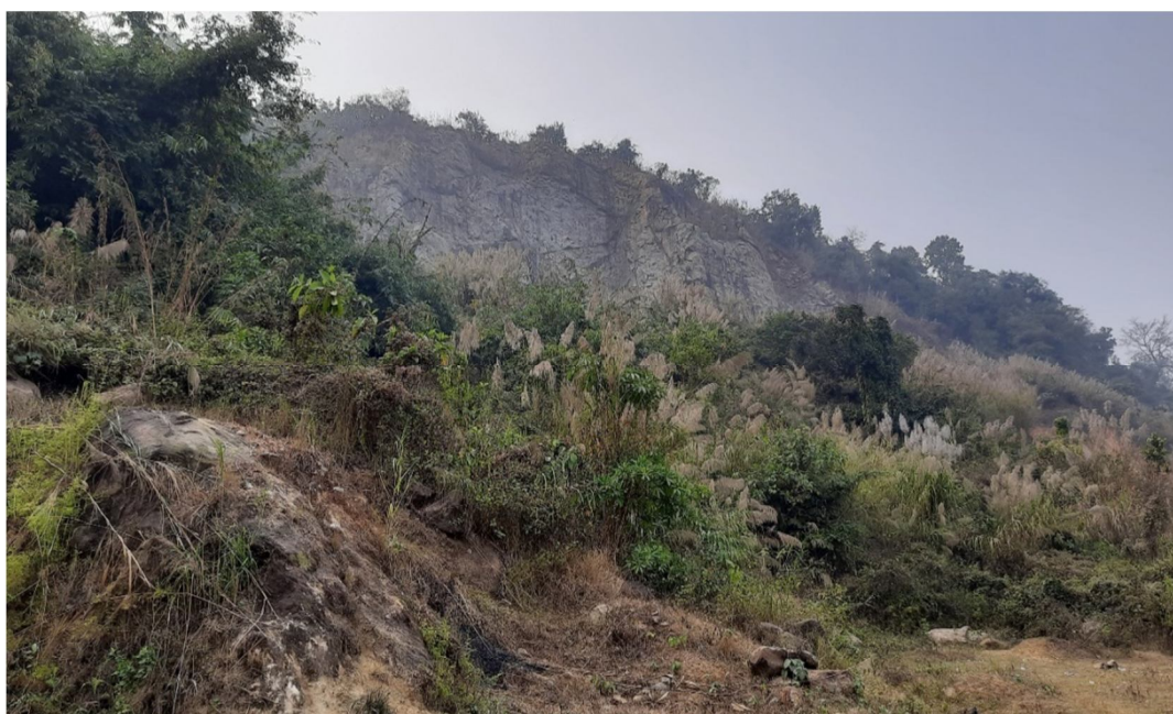
Fig. 9 Field photograph showing three sets of joints in granite