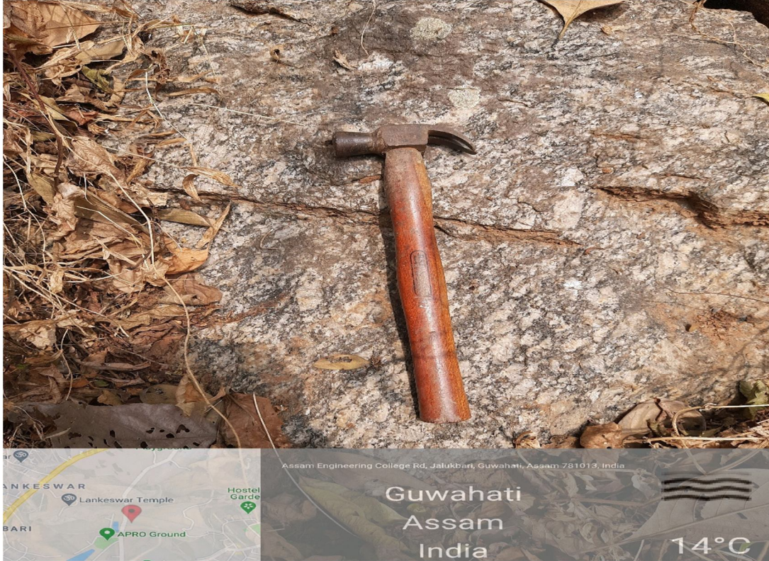
Fig. 6 Field photograph showing coarse grained granite

The study area is dominated by coarse grained granite. Massive granite present in the study area is very rugged or sharp, showing no weathering (Fig.7). Minerals present in granite are very coarse grained rose (pink) quartz, mica and feldspar with sharp contact with each other (Fig. 6). One set of less prominent joint is also observed in the study area. Very sharp contact of minerals of granite indicates very low or no metamorphic effect.