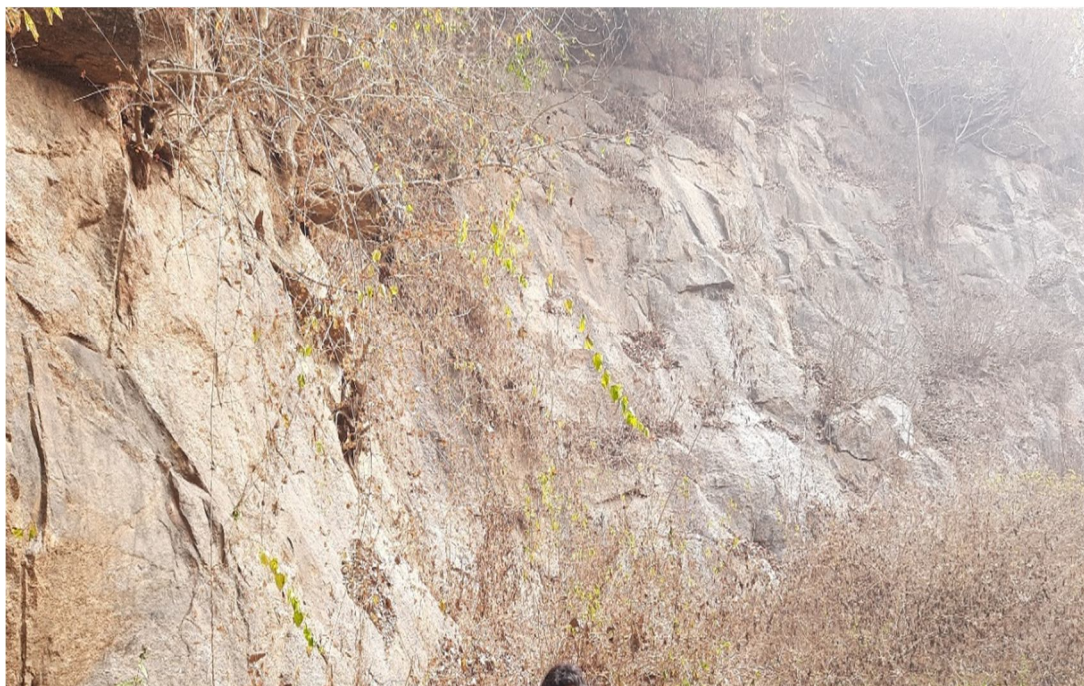
Fig. 7 Field photograph showing one set of less prominent joint in massive granite