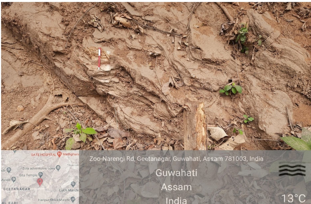
Fig. 3 Field photograph showing the foliations of weathered bedrock