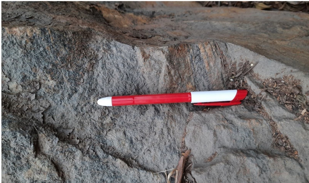
Fig. 11 Field photograph showing alternate bands of quartz and mica laminations

The Borbari area is dominated by medium grained granites where thin alternate bands/laminations of mica and quartz are very prominent (Fig. 11). Granites are sharp and medium grained. Presence of weathered granites is also observed in the area.