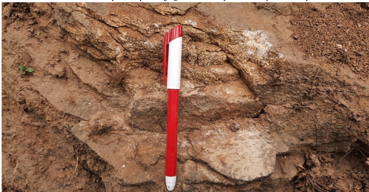
Fig. 2 Field photograph showing weathered granitic rock of Location 1

In the present study, Geetanagar (Geetamandir hill top) is studied in depth and found that Geetamandir hill top is exclusively made up of weathered soil cover of pre-existing rock. No fresh exposed bedrock is seen near the Geetamandir area. One small exposurer of weathered bedrock is observed in the present location which is near the Geetanagar Rajahuwa Shani temple (Fig. 2, 3). This exposurer is a weathered rock mass of pre-existing rock of granitic origin. Grain size is medium. Weathered quartz grains are clearly visible in the weathered rock mass. Distinct foliation plane depicts high grade metamorphism in the present study area.