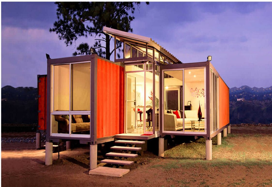
Fig1.1 Container House

Containers are a method of building, packaging and deploying software. A container includes all the code, runtime, libraries and everything else the containerized workload needs to run.