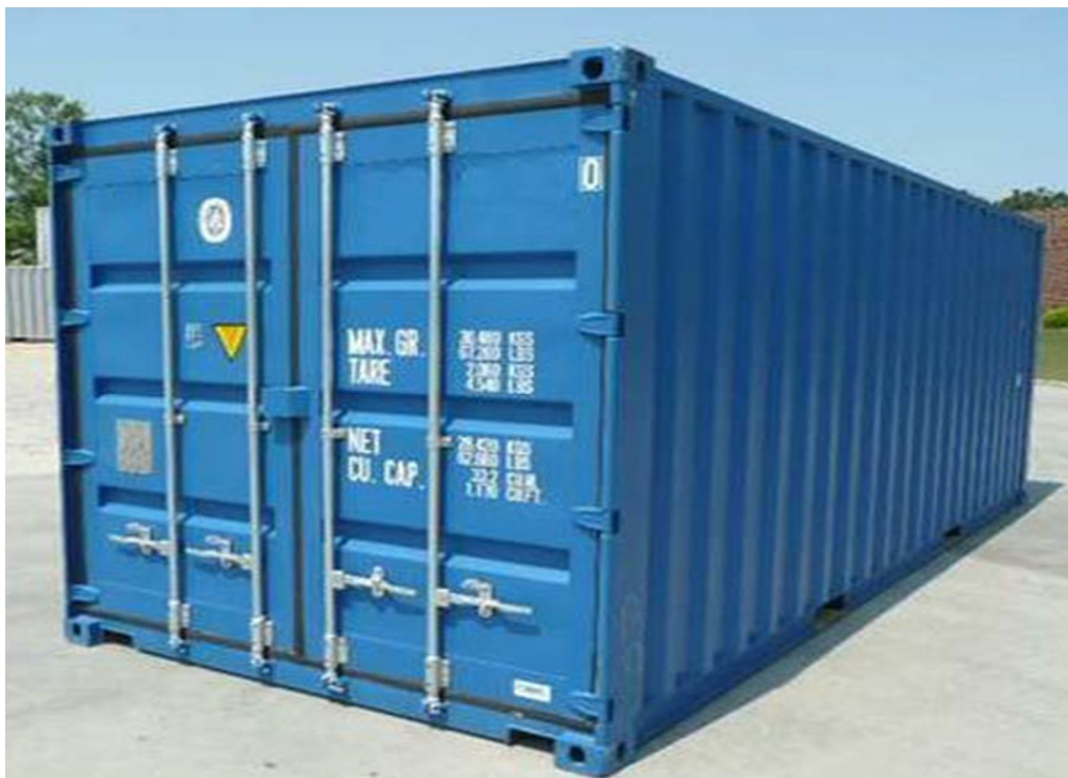
Fig 3.2 20ft Shipping Container