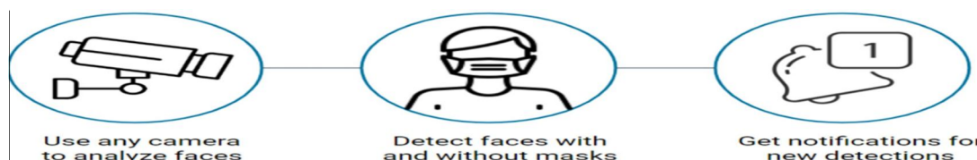
Fig – Proposed Architecture