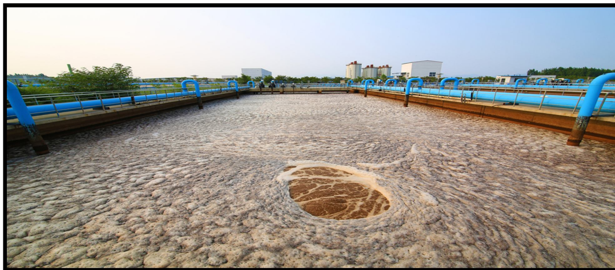
Figure. Sewage Sludge

Sewage sludge is defined as the residue obtained after the treatment of water in a municipal water treatment plant. This waste residue is very much rich in minerals and chemicals. In other words sewage sludge is the byproduct of the water treatment plants that is rich in minerals, chemical and biological agents. These chemicals and minerals can be used in soil for improving its nutritional properties. This waste can also be used for the soil stabilization process that involves in improving numerous engineering and non-engineering properties of the soil. Basically after getting this waste, this waste is dumped in open sites and this dumping is very much hazardous from the ecological point of view. So therefore an alternative should be determined so as to prevent its harmful effects over the environment.