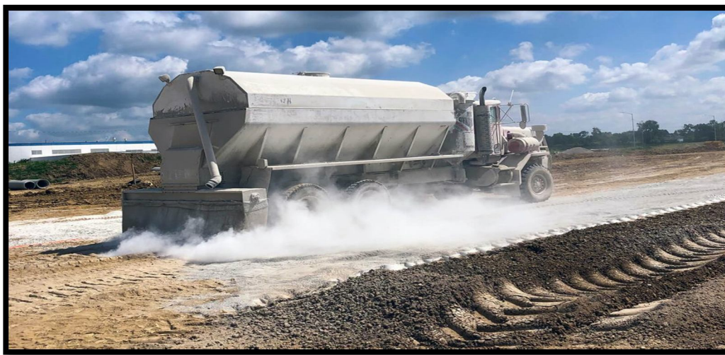
Figure. Soil Stabilization

Soil stabilization is basically the process of improving the engineering and non-engineering properties of the weak soil using various kinds of chemical and mechanical techniques. Various chemical additives can also be used for the stabilization process of soil that includes several chemical, several ashes, several fibers, and several supplementary cementitious material. In this review article the usage of sewage sludge and biomass ash has been discussed in detail.