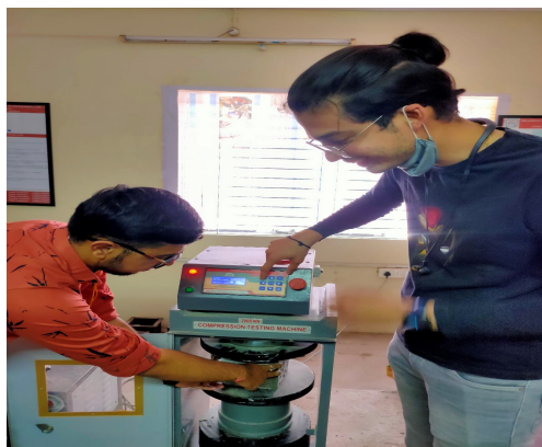
Fig. 5 Checking the compressive strength