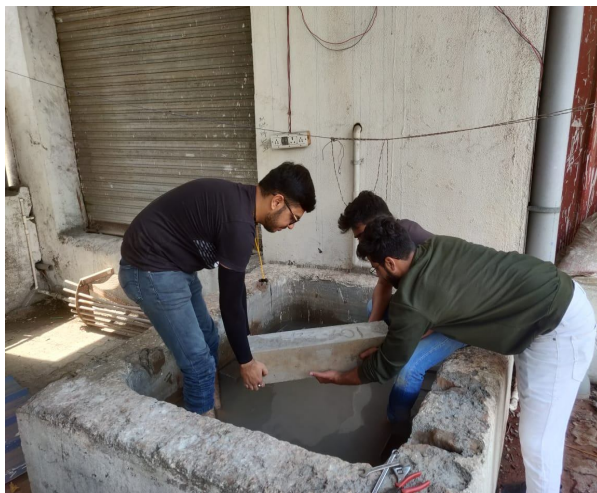
Fig. 4 Placing the blocks for curing