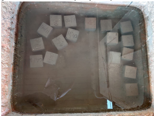
Fig. 3 Concrete blocks placed for curing in curing tank

Curing of Concrete is a method by which the concrete is protected against loss of moisture required for hydration and kept within the recommended temperature range. Curing will increase the strength and decrease the permeability of hardened concrete. The blocks are tested for compressive strength test after 7, 14 and 28 days respectively.