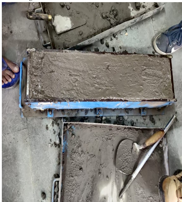
Fig. 8 Casting of concrete beam