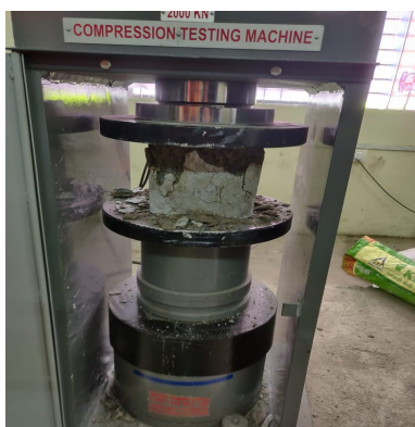
Fig. 6 Compression testing machine