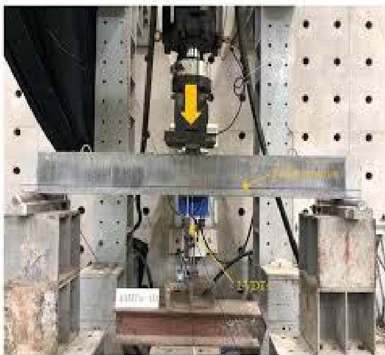
Fig. 7 Flexural strength testing machine

It is the ability of a beam or slab to resist failure in bending. It is measured by loading unreinforced 150x150 mm concrete beams with a span three times the depth (usually 450mm). The flexural strength is expressed as “ Modulus of Rupture” (MR) in MPa. Flexural Strength is about 12 to 20% of compressive strength. However, the best correlation for specific materials is obtained by laboratory tests.