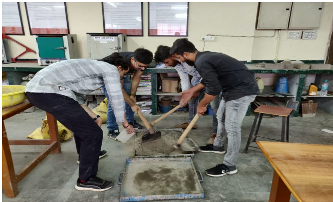
Fig. 2 Group members casting concrete blocks

This molten material is then poured into a mould cavity that takes the form of the finished part. The molten material then cools, with heat generally being extracted via the mould, until it solidifies into the desired shape.