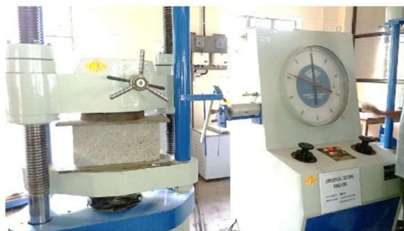
Fig 2. Testing of Solid Concrete Block

Solid Concrete Blocks (300*200*200 mm) were casted for compressive strength. Compaction of the concrete blocks was done using machine. The specimens were demoulded after 24 hours and subsequently immersed in water. Each specimen was tested for the determination of average compressive strength. The test was performed on Compressive Testing Machine (CTM).