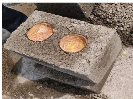
Fig.1 : Solid Concrete Block casted with Coconut Shell