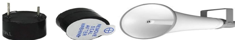
Fig.(d): Bhonga spekar

A buzzer is a loud noise maker. Most modern ones are civil defense or air- raid sirens, tornado sirens, or the sirens on emergency service vehicles such as ambulances, police cars and fire trucks. In this farm watchman machine with the buzzer (loud noise system) LED also put in same one for lighting purpose in agricultural area so wild animal away from this.