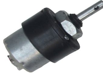
Fig.3 D C motor.

A DC motor is any of a category of rotary electrical motors that converts direct current electrical energy into mechanical energy. The maximum not unusual place sort rely upon the forces produced via way of means of magnetic fields. Nearly all types of DC motors have few inner mechanism, both electromechanical and electronic, to periodically alternate the path of current in part of the motor.