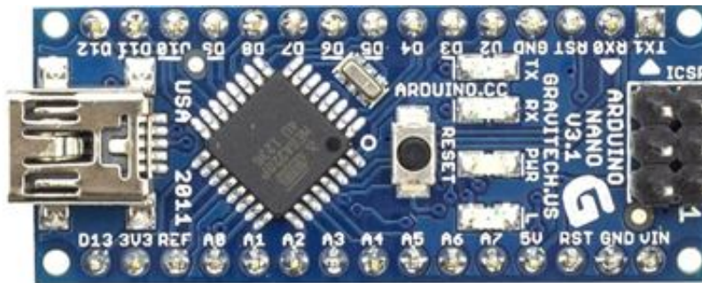
Fig.4 Arduino nano unit

In 2019, Arduino launched the Arduino Nano Every, an pin-equal evolution of the Nano. It capabilities a greater effective ATmega4809 processor, and two times the RAM.