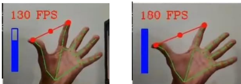
Fig. 2 Controlling Volume with hand gesture