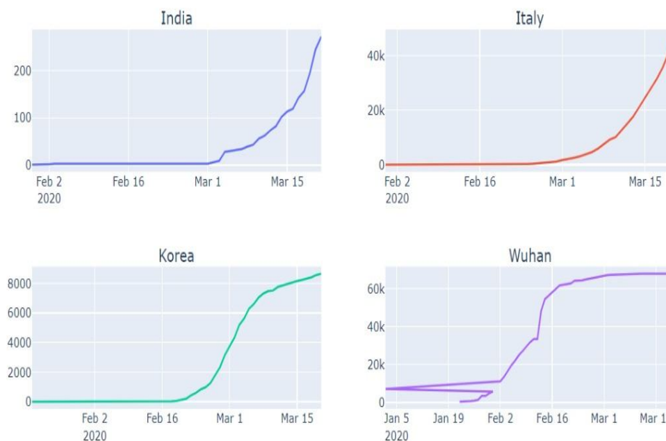
Total Cases in 4 countries