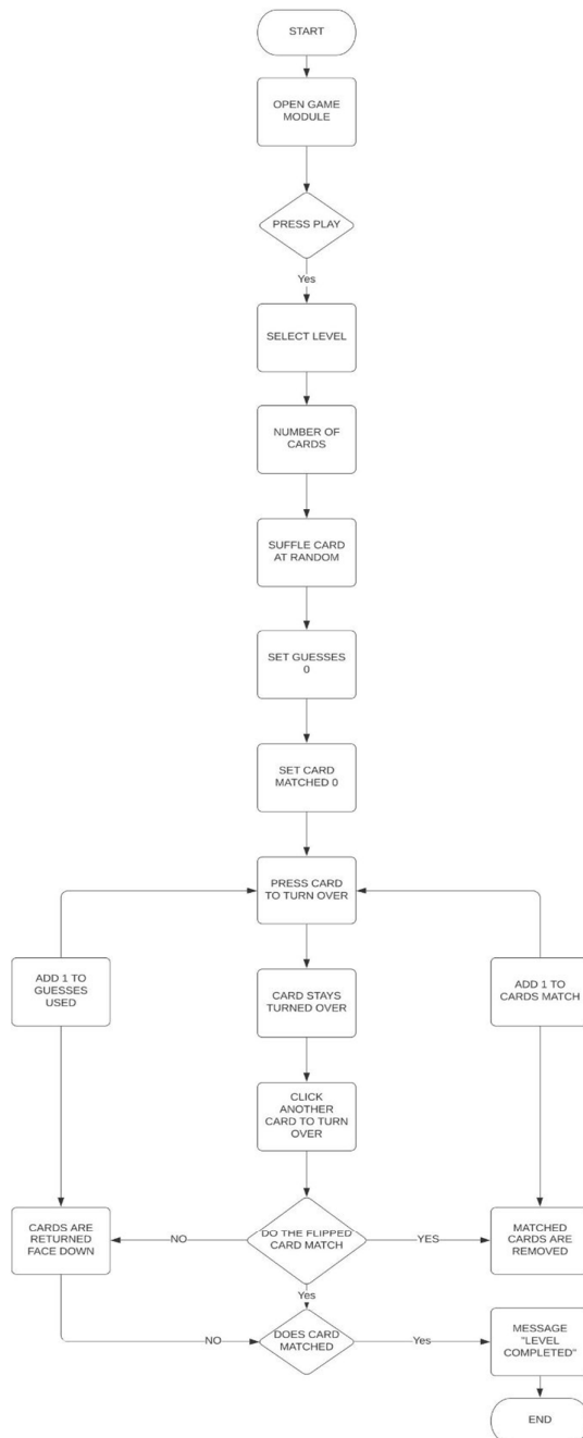
Fig. 1 Flow chart of game module