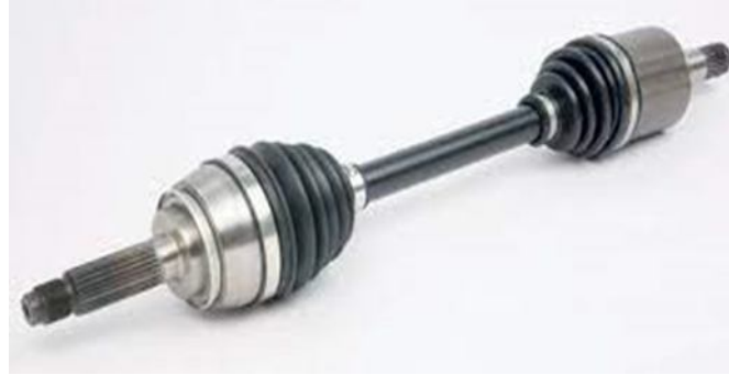
Fig.4 Drive Shaft

The force shaft connects the wheels with the gearbox. Drive shaft is made from slight steel. There are 2 connecting rods. One is positioned in touch with the gearbox and paired to the wheels. The different shaft is positioned in reference to the gearbox that is linked to the rotavator shaft. The gearbox whilst given force, splits the force into 2 paths. One is to force the wheels and the alternative is to force the rotavator.