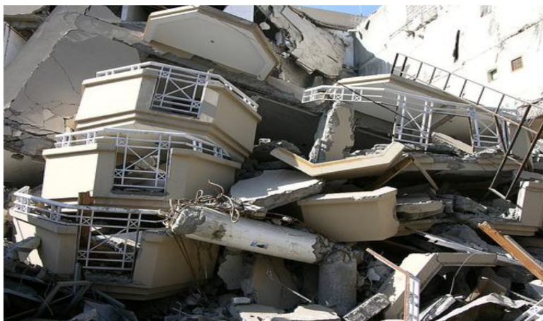
Fig. 1: A Total Collapsed Building