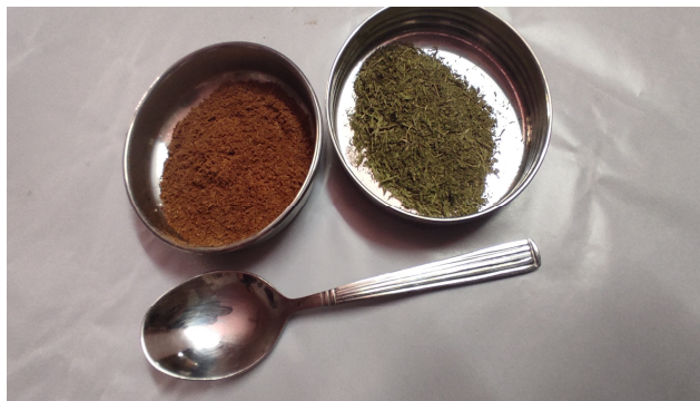
Fig 4: cinnamon and Thyme leaves

Place it in a bowl add cinnamon, Thyme, Honey and vinegar into the paste and mix it well. Squeeze the mixture between the baking parchment paper.