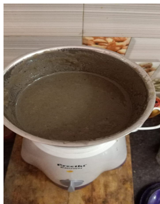
Fig 1: Blending of banana peel and water.

Take 2-3 Banana peels and cut the banana peels into small pieces. Put the banana peel and 250 ml water together in the mixy jar and blend. Boil the obtained paste after blending. Filter it and remove the excess water from the paste.