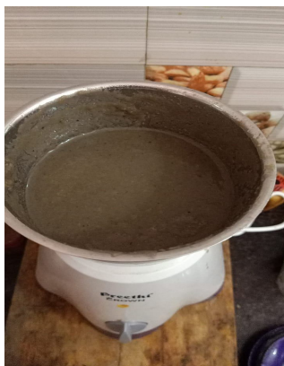
Fig 1: Blending of banana peel and water.

Take 2-3 Banana peels and cut the banana peels into small pieces. Put the banana peel and 250 ml water together in the mixy jar and blend. Boil the obtained paste after blending. Filter it and remove the excess water from the paste.