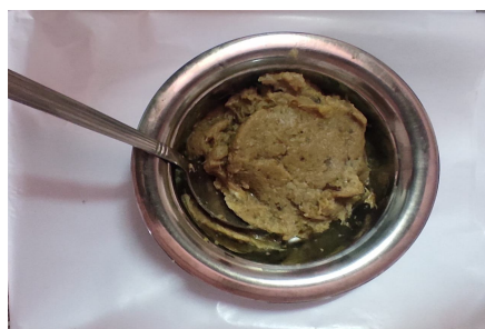
Fig 3: Filtered and dry residue of banana peel paste