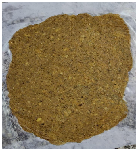
Fig 6: Mixture squeezed between baking paper