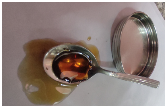
Fig 5: Honey and Vinegar