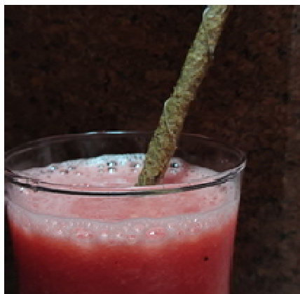
Fig 8: Juice served using bio straw