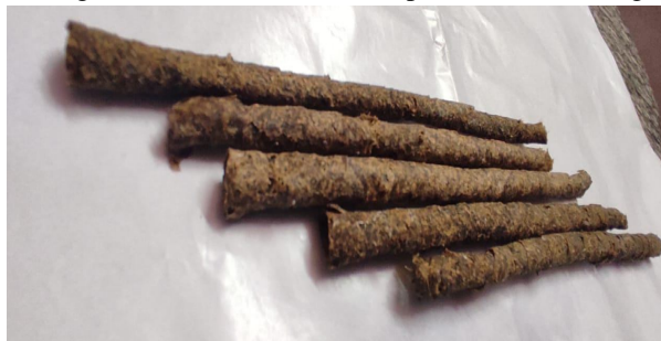
Fig 7: Bio straw

We have produced the biodegradable straw and tested the straw against the different beverages. It is resistant to water when dipped in the beverages like fruit juice, shake, soda and water. This biodegradable straw doesn't make any harm to human health while drinking and this straw is made of natural ingredients and waste banana peel so it can be degraded easily after use.