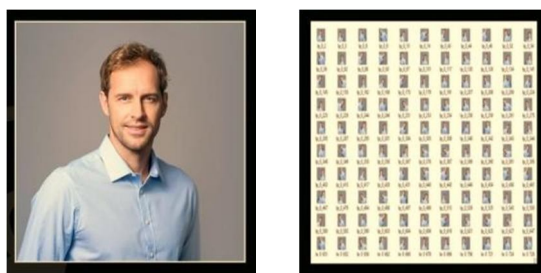
Fig: Image Augmentation Result

After augmentation, the result set of images are split into train and test sets. Further, the model is trained for real time face detection. The video streaming from the camera will be continuously monitored and tested against the stored model. If the system finds the exact match, the notification containing the details of the person will be sent to the concerned authorities.