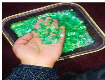
Fig 1 waste PET