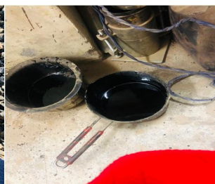
Fig 3 bitumen