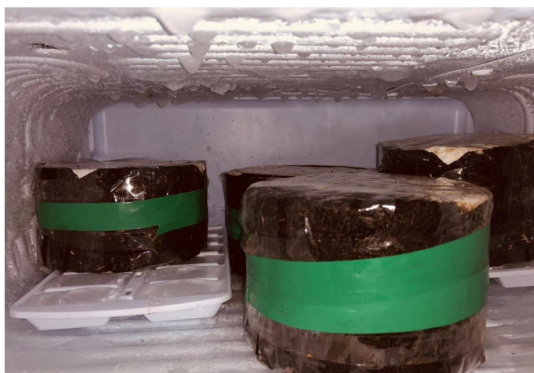
Fig 5 , samples under freezing