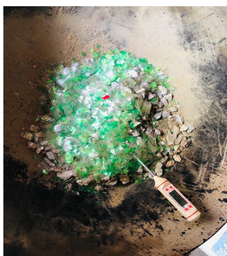
Fig 3 waste PET added to aggregates