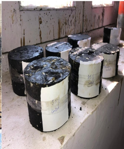
fig 4 samples with varying bitumen content