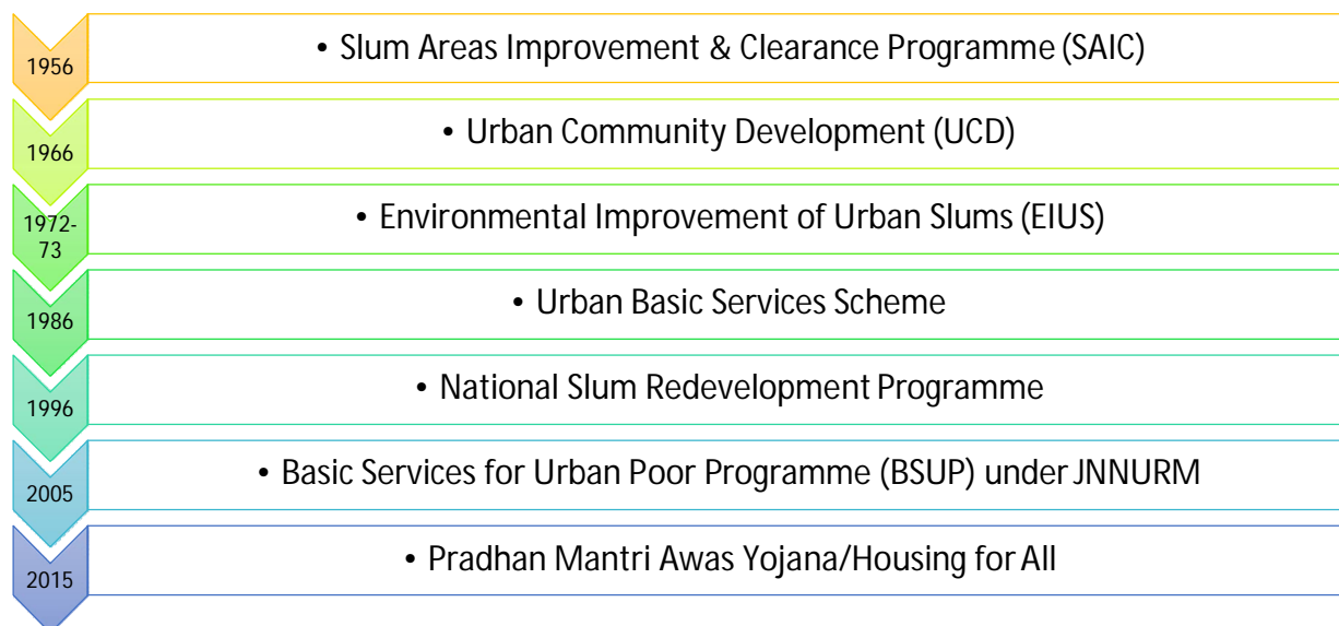
Figure 1: Slum Improvement Schemes in India

There is large history of policies and schemes implemented to fight against slum issues in India. The policies and various Acts have from slum demolitions to the slum improvement and slum redevelopment. After independence, slum issues became more prevalent because of rapid urbanization and industrial growth for this major policies and schemes were induced by the Indian Government and various States/UTs. These schemes are stated in the figure below.