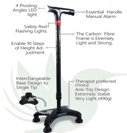
Fig.6 Smart walking stick