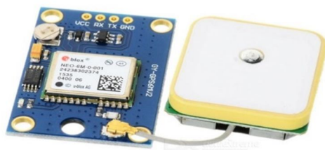
Fig. 2 GPS