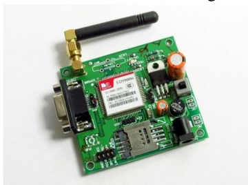
Fig.3 GSM Module