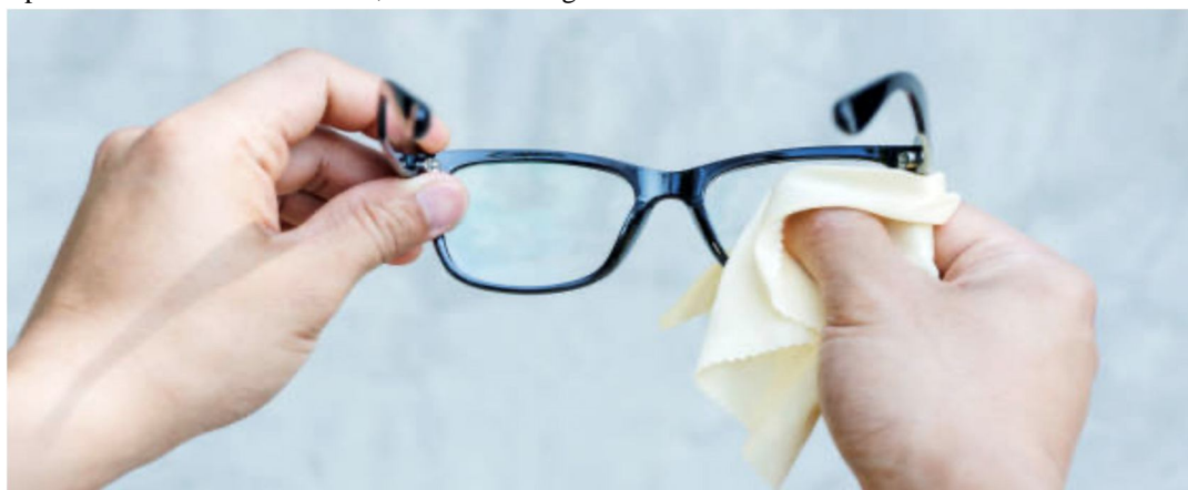
Fig.4 wiping glasses with clean piece of tissue paper.

Then, let the spectacles air dry or gently dry off the lenses with a soft tissue before putting them back on. Now the spectacle lenses should not mist up when the face mask is worn, as shown in Fig.4.