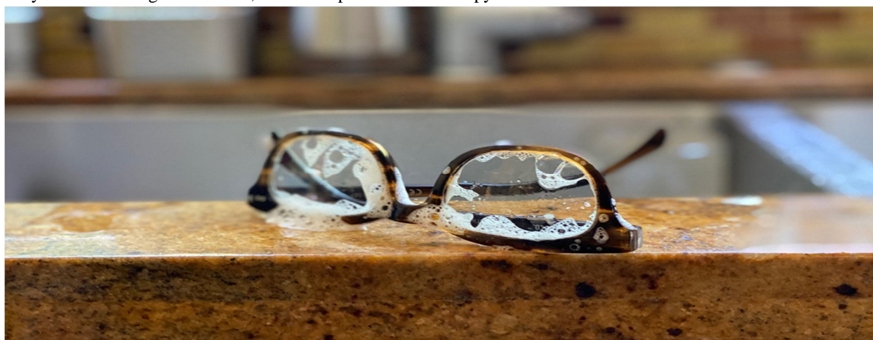
Fig.3 soap applied over glass surface and kept for sometime .

Immediately before wearing a face mask, wash the spectacles with soapy water and shake off the excess.