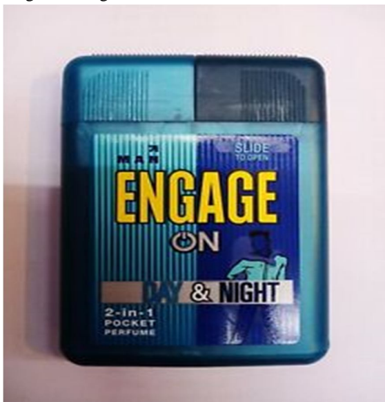
Fig.5 Empty pocket spray container for Soapwater solution