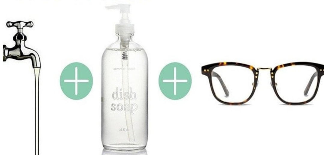
Fig.2 Combination of soap, water and spectacles.

2) Use of soap water to clear glass surface , for longer duration, as shown in Fig.2