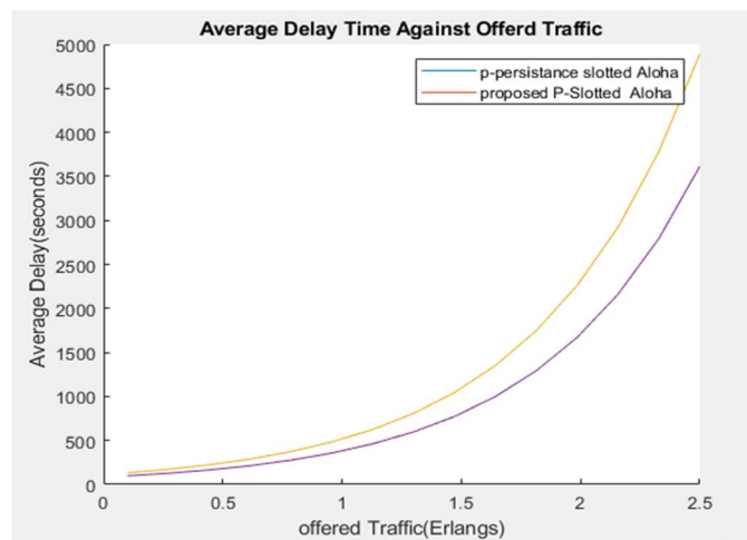
Fig. 2 Delay of P-slotted ALOHA protocol using SIC

In fig. 2 Delay performance using SIC In fig. 3 we can see the delay performance of proposed technique and p-persistent Slotted ALOHA Technique. p-persistent Slotted Aloha has higher delay which is 139.79seconds when offered traffic is low but proposed p-slotted ALOHA shows better performance with delay 116 which is better than previous thechinique. Proposed technique is 17% better delay performance than p-persistence slotted ALOHA.