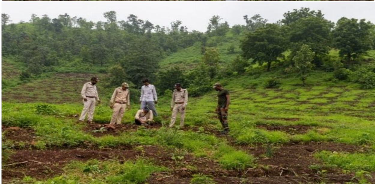
Seed germination observation in the different field