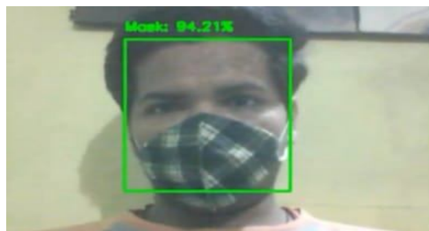
Fig.3 Detection of face with mask