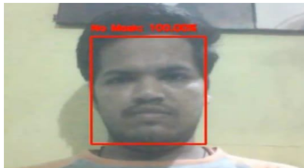
Fig.2 Detection of face without mask

This model accurately predicts a person is wearing a mask or not. It also displays the name of the person if it is available in the database. Red Colored Square is drawn around person's face to indicate he has not worn a mask. Green Colored Square is drawn around person's face to indicate he has worn a mask.