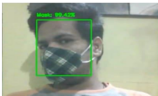
Fig.4 Detection of face with mask from side angles