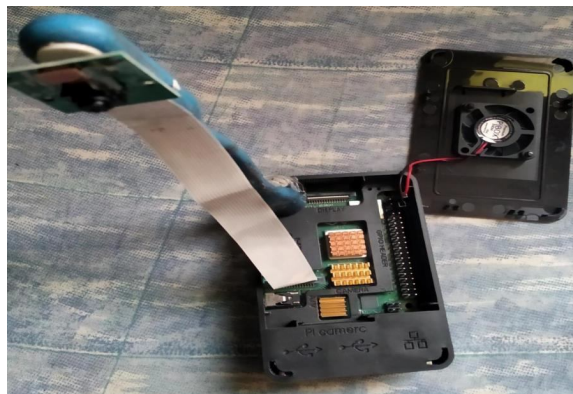
Fig.1. Connectivity of Camera with Raspberry Pi

The camera captures the live streaming photos. Then these frames are analyzed and the result obtained. The Pi camera module is a lightweight camera that can be connected to Raspberry Pi and is portable. It connects with Raspberry Pi victimization the MIPI camera serial interface protocol. It is normally utilized in image processing, machine learning, or surveillance projects. It is commonly utilized in surveillance drones since the payload of cameras is extremely less.