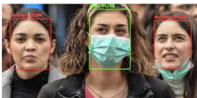
Fig.5.Detection of People with mask and non-mask

We can detect crowded places where it can be easily captured who have worn it or not. Images can also be inputted the system where classification can be possible as mask or non-mask as shown in figures.