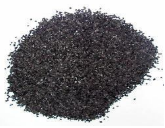
Fig. 2 Copper slag

The use of copper slag in the solid business as a bond substitution can possibly diminish transportation costs while additionally aiding the security of the dirt. Regardless of the way that a couple of studies have been led on the impact of copper slag replacement on the attributes of concrete, further exploration is needed to get an intensive information that will fill in as an establishment for permitting the utilization of copper slag in concrete.