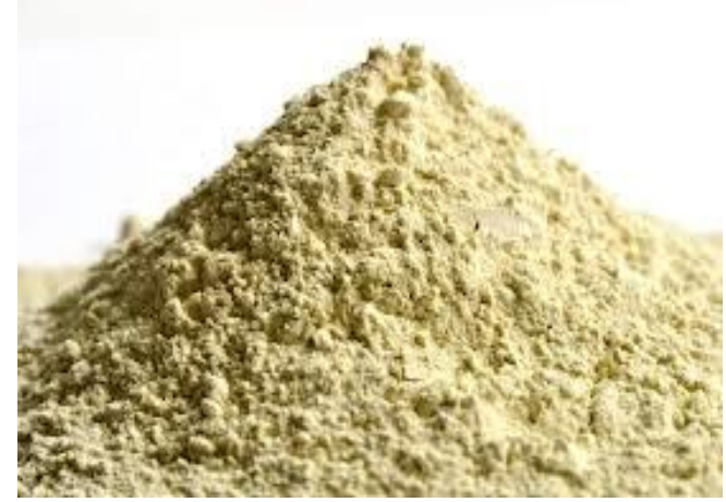
Fig. 1 Metakaolin

Volume 9 Issue IX Sep 2021- Available at www.ijraset.com