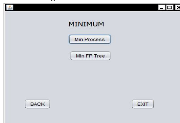
Figure 3: IWI selection