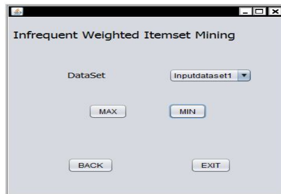
Figure 2: Selection of Dataset

Main.ta.append(" "+atr[j]+"("+max+")"+" "); if(max<0) { bw.write(" "+-max); if((atr[j]!=0) && (atr[j]!=temp1)) { //ab=" "+atr[j]; cc[g1++]=atr[j]; temp1=atr[j]; }