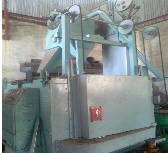
Fig. 1 Centrifugal shot peening system used

The important thing to conduct the experiment is to have proper layout of the experimental runs. Statistical software MINITAB 16 was used for the appropriate selection of orthogonal array as an experimental layout. Since the effect of four factors, shot size, shot flow rate, work height, exposure time has to be studied at 2 levels each; L8 orthogonal array was selected out of the resulted possible orthogonal arrays L8,