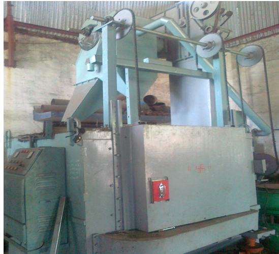
Fig. 1 Centrifugal shot peening system used

The important thing to conduct the experiment is to have proper layout of the experimental runs. Statistical software MINITAB 16 was used for the appropriate selection of orthogonal array as an experimental layout. Since the effect of four factors, shot size, shot flow rate, work height, exposure time has to be studied at 2 levels each; L8 orthogonal array was selected out of the resulted possible orthogonal arrays L8,