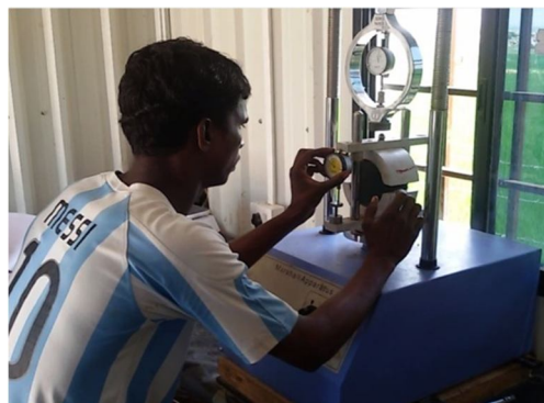
Fig.5: Marshall Stability Test Setup