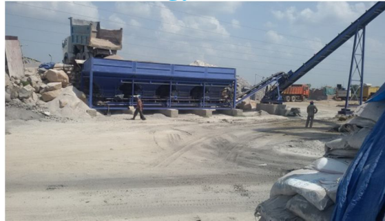
Fig.1: Grading of aggregate

Grading of aggregate as per Ministry of Road Transport and Highways Specification (MoRT&H) for bituminous concrete (Grading 2) The selected gradation and specification limits are shown in Table 3 and graph. 1.