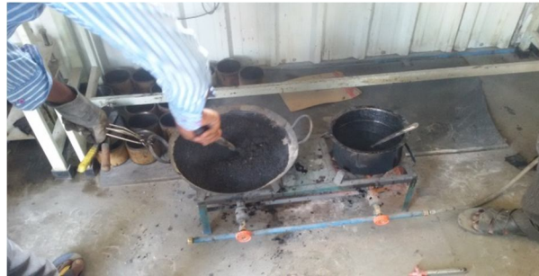
Fig.3: mixing of bitumen concrete