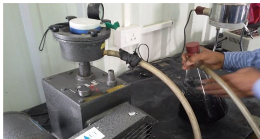
Fig.4: Air Voids determination setup

The properties of Marshall Specimens as per MORT&H are given in Table 5. For testing of stability, flow, indirect tensile strength (ITS), marshall specimen of 101.3 mm diameter and 63.5 mm height using 75 blows on both sides were prepared by standard rammer at 155°C as per procedure described in ASTM D 1559. The optimum binder content for both mixes are determined and the properties of mixture at OBC is given in Table 6. The results of stability, flow, Marshall quotient (stability/flow) along with methods of test adopted are given in Table 6. Volumetric and engineering properties of mixes at varying crumb rubber content are given in Table 6. Retained stability test was conducted on Marshall samples of conventional bituminous mix as well as modified mixes at 25°C.