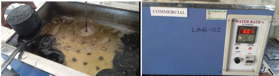
Fig 3 :moulds immersed in water bath for 24 hours

S2 = Marshall Stability for specimens immersed in water bath for 24 hours