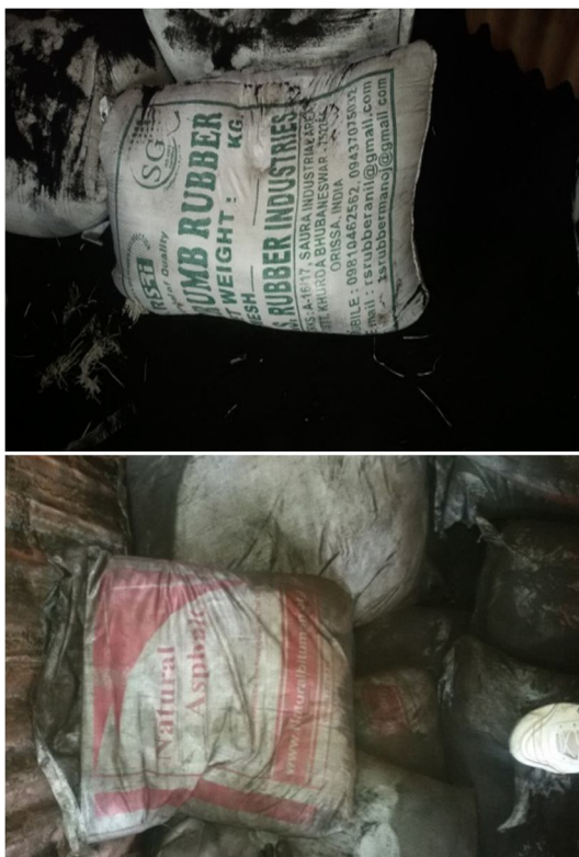
Fig.2: crumb rubber

Aggregate from local quarry (Timmapur quarry) (quartzite type) is used for the preparation of bituminous mixes. The results of physical properties of aggregates are given in Table 2.