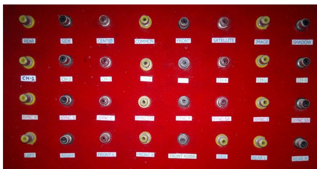
Fig. 2 32 lines Input

The output and input connections are through A/V ports so that there is an ease for plug and play. The 32 input lines are shown in figure 2. More ever many multi input and multi output ports have been used to make the system free from mesh of wires. Proprietary connectors are also used to combine several different wires into one connector. It is done to reduce cable clutter and for the ease of installation.