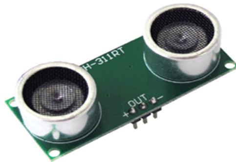
Fig.2. Ultrasonic Sensor

Ultrasonic Sensor is very common type of sensor detecting object and measuring the distance. The GH- 311 Ultrasonic Motion Sensor provides precise, non-contact distance measurements from about 2cm to 3m. It is very easy to connect to microcontroller. The sensor is mainly used for detecting obstacles and measuring the distance between robot and the objects. The ultrasonic sensor works by transmitting an ultrasonic (well above human hearing range) burst and providing an output pulse. By measuring the echo pulse width, the distance from the object can be calculated.