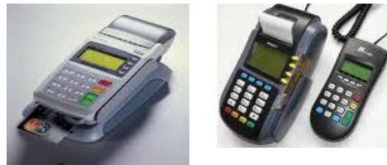
Fig. 2: PoS Terminals