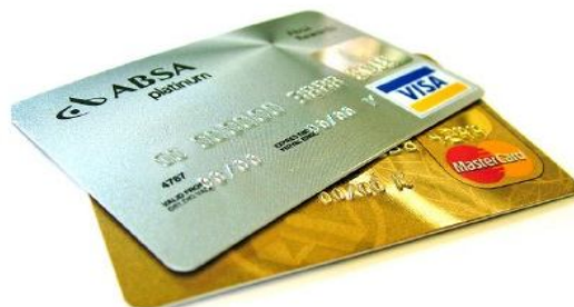
Fig. 1: Credit cards issued by VISA and MasterCard

suggests, is that in this case funds are withdrawn directly from the purchaser's bank account, rather than accumulating credit which then has to be paid off at a later date, potentially with interest. Debit cards became popular later than credit cards, but are particularly favored by the banks over alternative more traditional payment methods, such as cheques, which are much more costly for them to process.