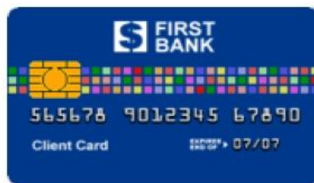
Fig. 3: An ATM Card

An Automated Teller Machine (ATM) card is a card issued by a bank, credit union or building society that can be used at an ATM for deposits, withdrawals, account information, and other types of transactions, often through interbank networks. ATM cards are typically about 86 \times 54 mm. Unlike a debit card, in-store purchases or refunds with an ATM card can generally be made in person only, as they require authentication through a personal identification number or PIN. In other words, ATM cards cannot be used at merchants that only accept credit cards. However, other types of transactions through telephone or online banking may be performed with an ATM card without in-person authentication. This includes account balance inquiries, electronic bill payments or in some cases, online purchases.