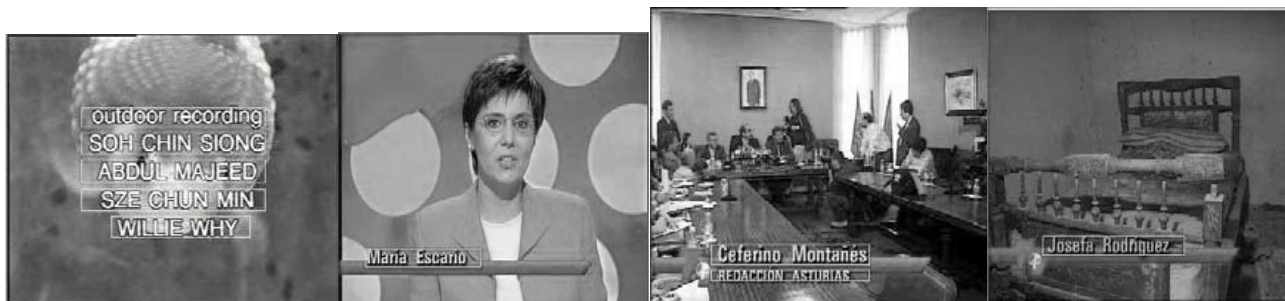
Figure 4 four image with detection result

ICDAR 2003 test set contains 258 real scene picture. Also some random images from web are used as dataset so that dataset cover's a variety of text in different size, style, font, light text on complex background and text of poor qualities, etc. following categories has been defined for each detected block.