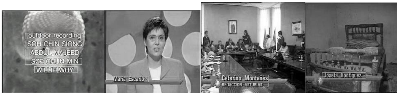
Figure 4 four image with detection result

ICDAR 2003 test set contains 258 real scene picture. Also some random images from web are used as dataset so that dataset cover's a variety of text in different size, style, font, light text on complex background and text of poor qualities, etc. following categories has been defined for each detected block.