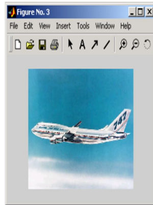
Figure 4.4: JPEG Image