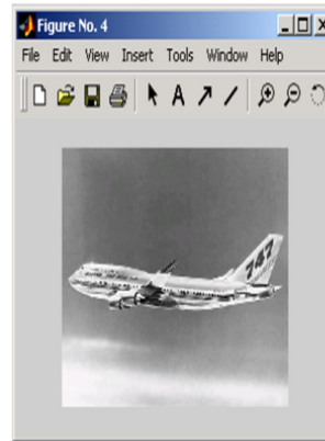
Figure 4.5: Grayscale Image

After completion of pre-processing the segmentation process will take place. In edge segmentation we are using Canny method to find out the edges accurately. Then our system uses Threshold method to separate the background and foreground image. After separation of background and foreground the software used HOG algorithm to extract the features like gradient, magnitude and angle. These features are useful to find out the fire and non fire images. Our system uses SVM classifier to classify the images.