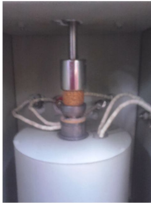
Fig. 3: Dielectric cell with PZT sample