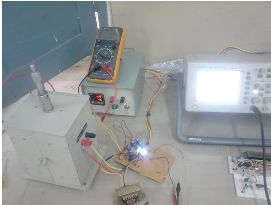
Fig. 4: Frequency measurement setup.

The experimental setup of this module for measuring the frequency of the PZT sample is shown in the Fig 4. The PZT sample is placed between the parallel plates of dielectric cell. The dielectric cell provides two probes for measuring the capacitance of the sample. These two probes are connected to 5 th and 6 th pins of MAX 038 IC. The RC oscillations are kept constant by selecting the adequate values for required frequency. The output of the MAX 038 IC is connected to the microcontroller. The microcontroller measures the frequency [6] of the waveform, which is from MAX038 and displays the output frequency on the LCD.