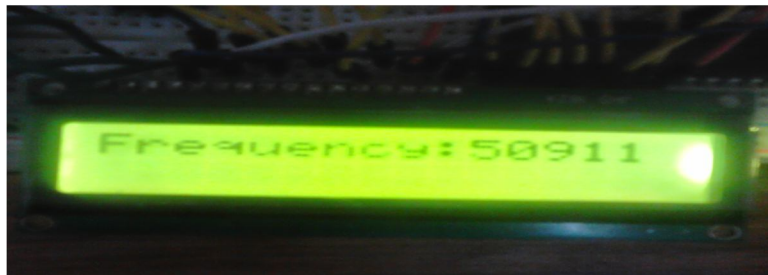
Fig. 2: 16x2 LCD

The LCD is used to display the alphanumeric values in 5x7 or 6x8 matrix pixel format. In this current work 16x2 LCD with 5x7 Matrix display format is used. The output frequency of the MAX038 is displayed on the LCD as shown in Fig.2.