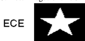
Figure 4. Watermark Images of size 64 \times 64