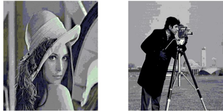
(a)Watermarked Lena (b) Watermarked Camera man Figure 5. Watermarked Images