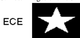
(a) Binary image ECE (b) Star Figure 4. Watermark Images of size 64 \times 64