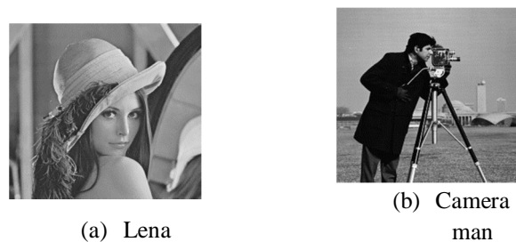
Figure 3. Host Images of size 512 \times 512

The host images used for experimentation are Lena and Camera man, each of size 512 \times 512 pixels, 8 bits/pixel and the watermarks used are binary images ECE and star, each of size 64 \times 64 .