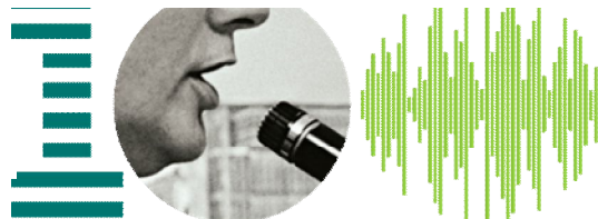
Fig.1: Voice to corresponding frequency waves

Speech is the most natural way to communicate for humans. While this has been true since the dawn of civilization, the invention and widespread use of the telephone, audio-phonetic storage media, radio, and television has given even further importance to speech communication and speech processing. The advances in digital signal processing technology has led the use of speech processing in many different application areas like speech compression, enhancement, synthesis, and recognition. The concept of a machine than can recognize the human voice has long been an accepted feature in Science Fiction. From „Star Trek to George Orwell’s „1984 - “Actually he was not used to writing by hand. Apart from very short notes, it was usual to dictate everything into the speak writer.” - It has been commonly assumed that one day it will be possible to converse naturally with an advanced computer-based system.