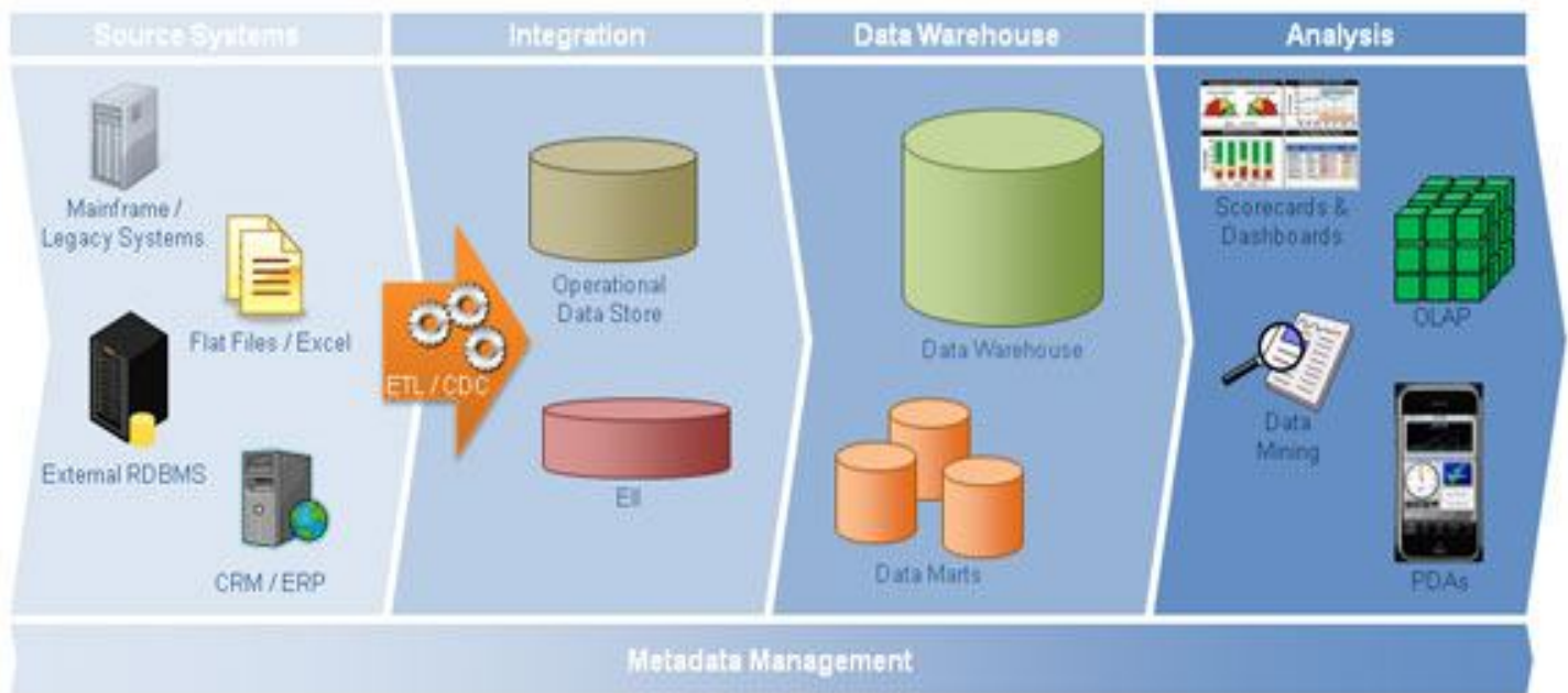
Fig ii) Business Intelligence-A High Level Architecture.

Various business intelligence companies have developed such software programs in order to help business owners gain a comprehensive view of their company's data. While there are many different advantages that come with integrating a computer application with a specific organization's business intelligence for finance, there are a few aspects of this technology that make it superlatively advantageous. One the fundamental successes of any Business Intelligence initiative is developing a consistent, single "version of the truth" across all sources of information, yet this is also one of the most challenging. [10]