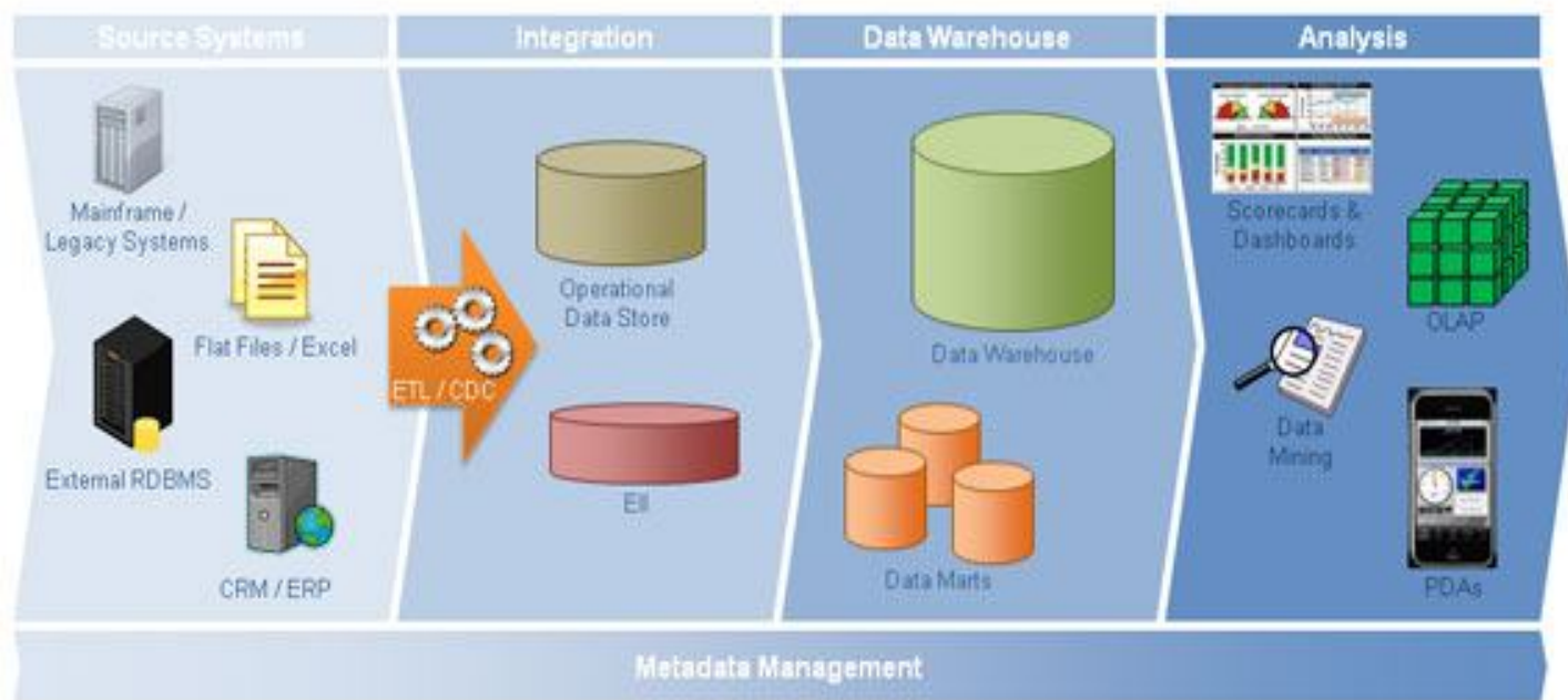
Fig ii) Business Intelligence-A High Level Architecture.

Various business intelligence companies have developed such software programs in order to help business owners gain a comprehensive view of their company's data. While there are many different advantages that come with integrating a computer application with a specific organization's business intelligence for finance, there are a few aspects of this technology that make it superlatively advantageous. One the fundamental successes of any Business Intelligence initiative is developing a consistent, single "version of the truth" across all sources of information, yet this is also one of the most challenging. [10]