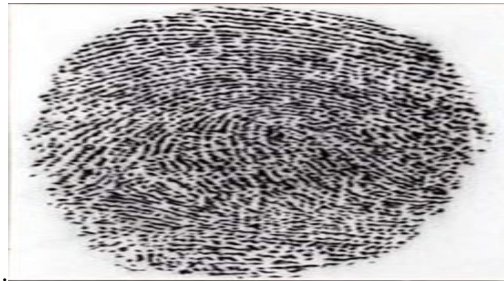
Figure 1.2 2D finger print Image

Fingerprints are distinguished using their functions. Normally, fingerprint functions with 2d images usually are classified inside several degrees. Level 1 function are thought as the macro information on fingerprints many of these while singular points combined with global ridge designs, e. g. deltas and cores. They are generally mainly to get fingerprint distinction or indexing compared to recognition due to the fact there're not so distinct. Level 2 features are likely to be minutiae (ridge endings joined with bifurcations). Such features would be the most distinctive joined with stable ones which were used in just about all AFRSs.