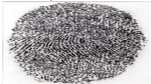
Figure 1.2 2D finger print Image

Fingerprints are distinguished using their functions. Normally, fingerprint functions with 2d images usually are classified inside several degrees. Level 1 function are thought as the macro information on fingerprints many of these while singular points combined with global ridge designs, e. g. deltas and cores. They are generally mainly to get fingerprint distinction or indexing compared to recognition due to the fact there're not so distinct. Level 2 features are likely to be minutiae (ridge endings joined with bifurcations). Such features would be the most distinctive joined with stable ones which were used in just about all AFRSs.