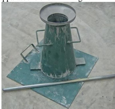
Fig 4.1 Slump cone apparatus

Slump test was carried out as per IS: 1199- 1959 (Methods of Sampling and Analysis of Concrete) to measure the consistency of concrete. The slump cone mould in the shape of a truncated cone with the internal dimensions 200mm diameter at the base, 100mm diameter at the top and height of 300 mm. The apparatus is shown in Fig 4.1