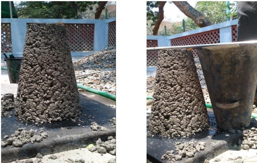
Fig 5.1 Result on zero slump

The workability calculated for this type of investigation is for four mix design including control mix. The other mixes are replaced by fly ash in cement for different ratios and the slump attained should be zero slump or true slump, the same test was used by Mukherjee et al.,(6)