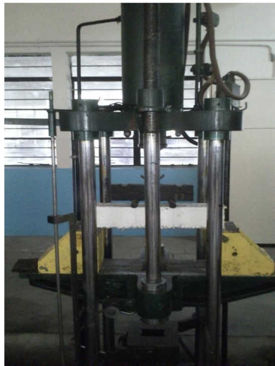
Fig 4.2 Static flexural testing machine

Flexural strength, also known as modulus of rupture, bend strength, or fracture strength. It is the ability of a beam or slab to resist failure in bending. The test set up for flexural test is in Fig 4.2 The bearing surfaces of the supporting and loading rollers shall be wiped out and any loose sand or other material removed from the surfaces of the specimen where they are to make contact with the rollers. The specimen shall then be placed in the machine in such a manner that the load should be applied to the uppermost surface as cast in the mould, along two lanes spaced 20.0 or 13.3 cm apart.