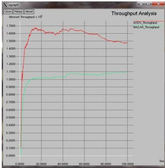
Fig 2: Network Throughput Analysis