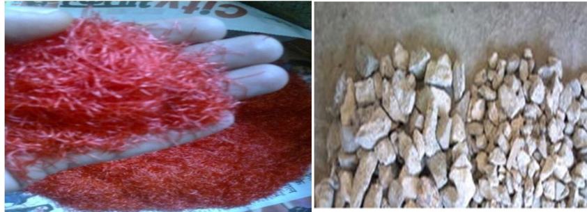
Fig (a). Polypropylene Fiber

The fibres are used either as short size and discontinuous fiber material for production of fiber reinforced concrete. Polypropylene twine is abundantly available, alike all manmade fibers of a consistent quality and cheap also. The fiber is cut into size 6mm length.