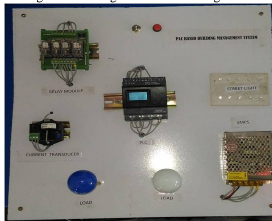
Fig.2 Prototype model proposed system