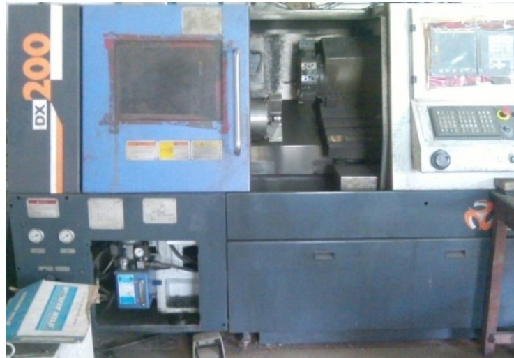
Figure 3 Photographic view of CNC machine

The machine used for turning is CNC lathe DX-200(Fanuc series) manufactured by Jyoti CNC Automation Pvt. Ltd. The actual photograph of CNC workstation used during experimentation is as shown in Figure 3