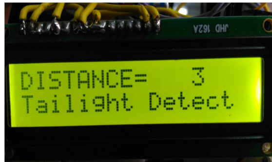
Fig. 6 Taillights Distance

the speed of the particular vehicle. This is shown in fig. 6.