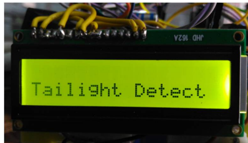
Fig. 7 Taillight Detected

When the taillight is detected using the ultrasonic sensor, the particular vehicle will be stopped automatically. And the taillight will be displayed using LCD unit. This is shown in fig. 7.