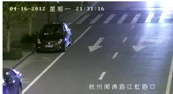
Fig. 3 Initial stage

microcontroller of an ultrasonic sensor [1]. AdaBoost classifier, our system is more reliable under various lighting conditions. When the vehicle is tracking and detecting using image segmentation. Taillight detects whether the vehicle is turn/break is applied at a particular time, that time the taillight is capture. It can be used both daytime and night time of the traffic signal. Initial stage of the image is shown in fig. 3.