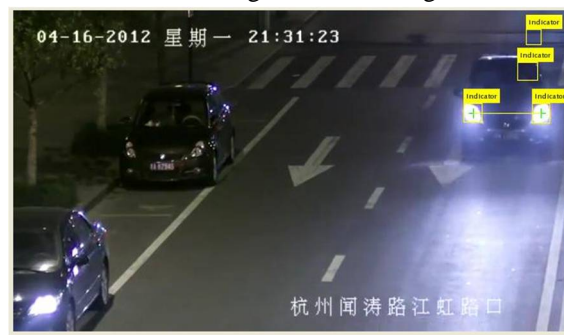
Fig. 5 Detected image

Vehicle tracks another vehicles passed on the road and it status detected via embedded camera, these in order were especially practical at the night time to keep away from the accident.