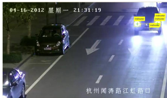
Fig. 4 Second stage

Second stage of the image is shown in fig. 4.