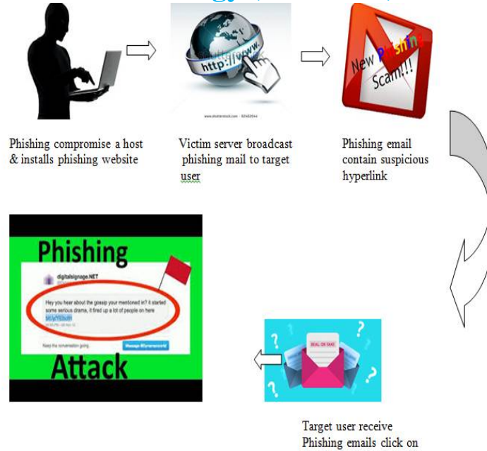
Fig 3: Phishing Scenario