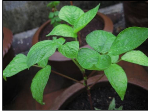
Fig. 1- Black gram planted in pot.

and day / night temperature of 30/18 0 C. Twenty seeds were sown per (each pot) treatment and the treatments were replicated three times. Sampling was done at random at 15 days interval from the treated and untreated pots for study. The experiments were repeated three times with 5 replicates per treatment. Plants were watered to field capacity daily. Plants were thinned to a maximum of five per pot. The data for various morphological parameters such as, root and shoot length, number of nodules, dry weight of root and shoot were also recorded.