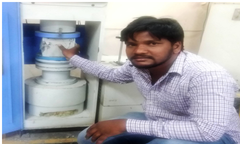
Fig. 1 testing of geopolymer concrete

Total 6 no. of cube casted for this test.Testing was done for 7 and 28 days after proper curing of specimens.Table 6 shows test results.