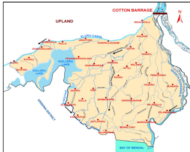
Fig 1: Study area of six streams

West Godavari is one of the 13 districts of Andhra Pradesh, India. West Godavari district occupies an area approximately 7700 square kilometers. It has 46 mandals: out of which 20 are in Upland and the rest in Deltaic region. The delta region is abundant with water sources and so agriculture, aquaculture and industries are surviving with these abundant water resources. Irrigation in West Godavari is carried on through a network of streams, namely Eluru stream, Narasapur stream, Venkayya Vayyeru stream, Gostani Velpur stream, Attili stream etc.