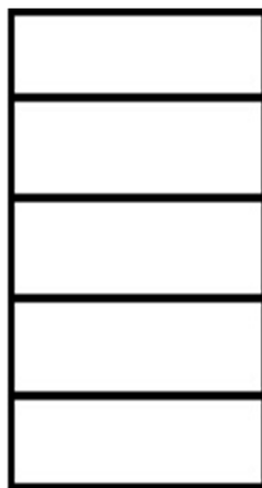
Figure 1- Compacted soil layers with no reinforcement

The sample was tested as listed above and values obtained are shown in table-1. After the tests on Natural Soil Specimen Unconfined compressive strength test was again conducted on soil specimen reinforced with jute fibers in 2-Layer and 4-Layers respectively as shown below: