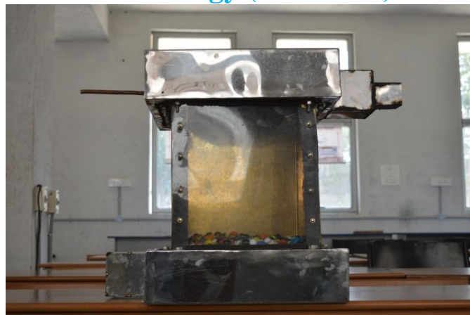
Fig. 2. Actual view of the specialized direct contact heat exchanger