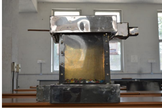
Fig. 2. Actual view of the specialized direct contact heat exchanger