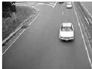
Fig.2. original video