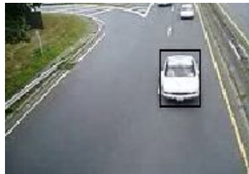
Fig.3. moving object tracking based proposed method