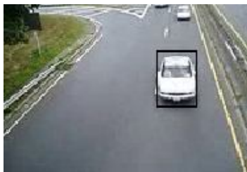
Fig.3. moving object tracking based proposed method